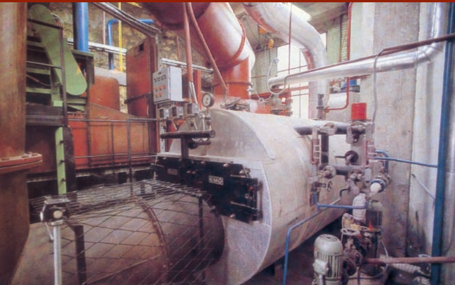
TREF Plant - Hospital Koševo - Sarajevo