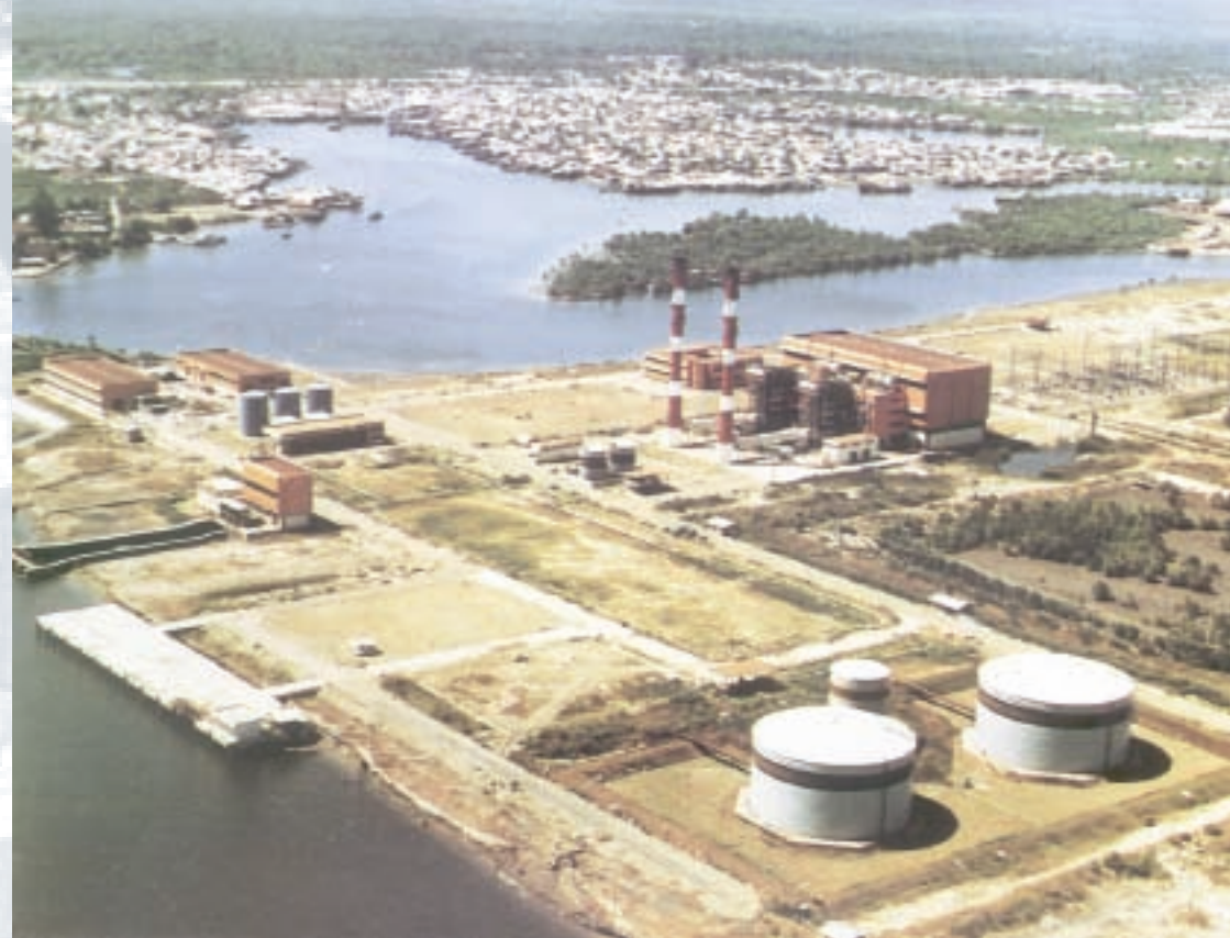
TPP Medan Indonesia 2x65 MW