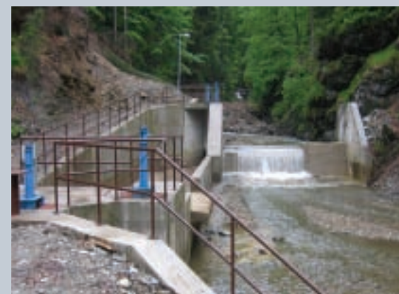
Small HPP, Fojnica

Design, Consulting and Engineering services in the field of power supply, civil engineering, water resources engineering and architecture.