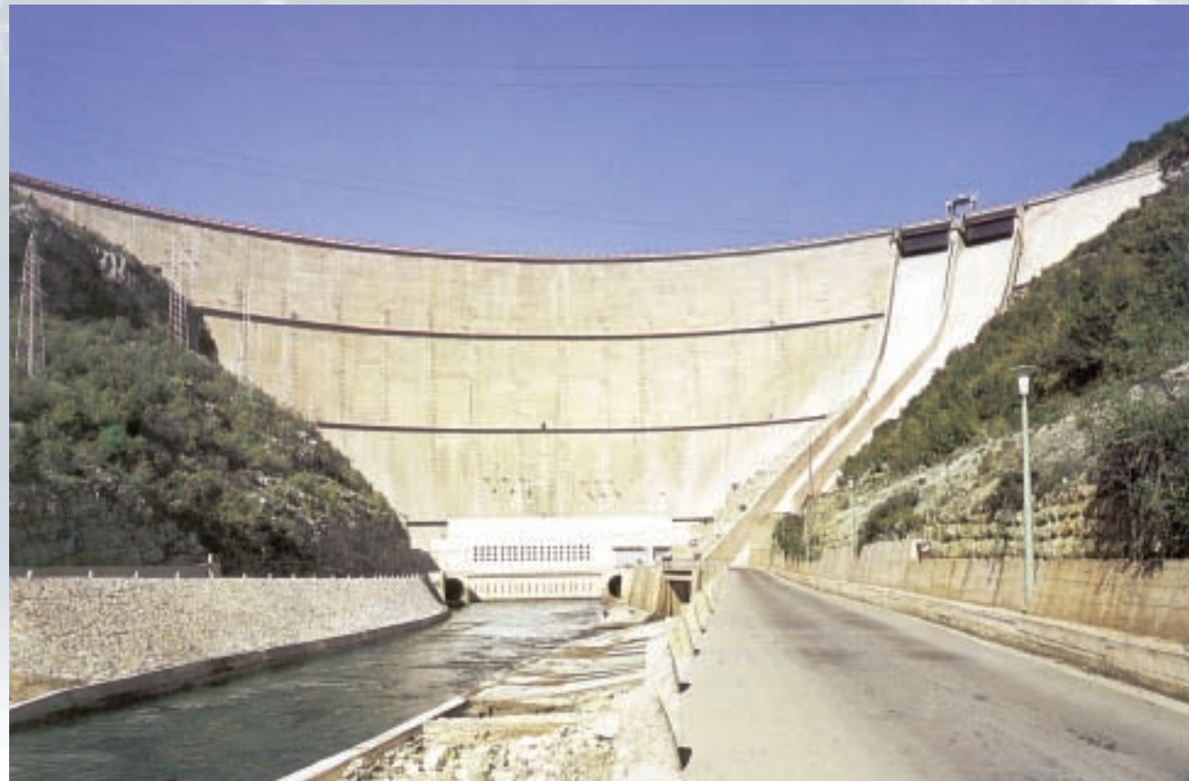
HPP Trebinje 3x60 MW