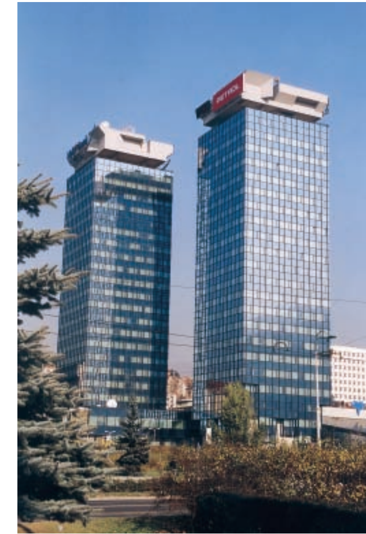
UNITIC Bussiness Center